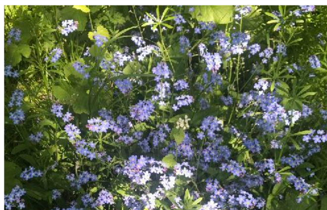
Forget-me-nots at Bawsinch

Details of all events, including directions and meeting point, can be found online at swtlothians.org.uk/events